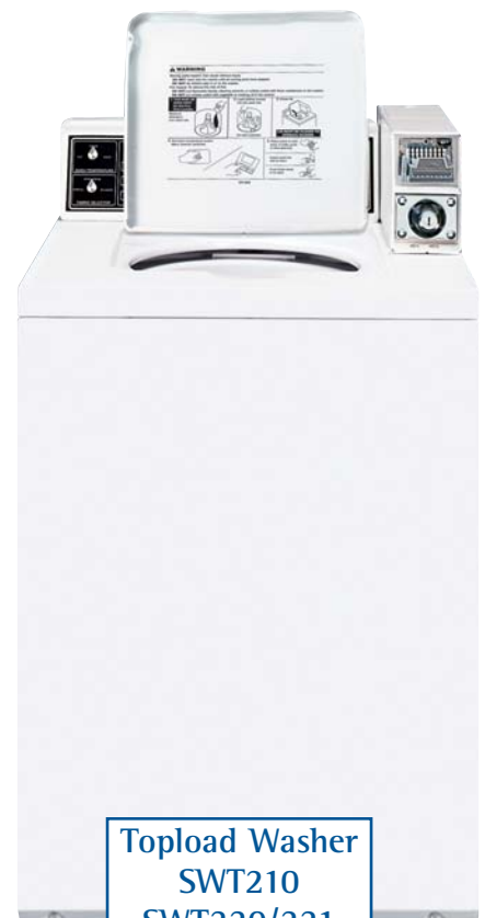
Topload Washer SWT210 SWT220/221