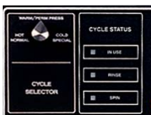
One-Speed Washer Electromechanical Control