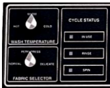
Two-Speed Washer Electromechanical Control