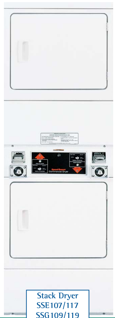
Stack Dryer SSE107/117 SSG109/119