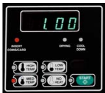
Fully programmable NetMaster™ control