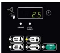
Micro-DISPLAY control (MDC)